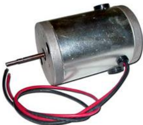
The side view of the motor