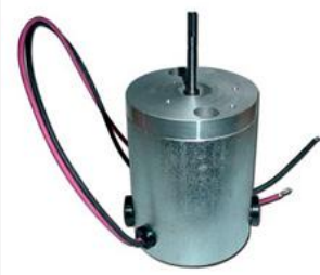
The upper view of the motor