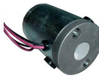
The back view of the motor