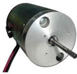
The front view of the motor