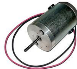
The whole picture of the motor